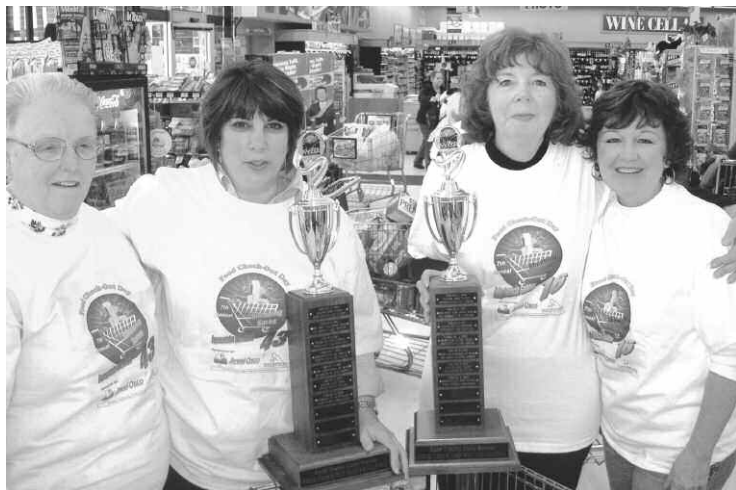
After the February 8 event, the competitors, together with their helpers from the food pantries, gather to receive their trophies and congratulate one another for a job well done. While Farm Bureau uses Food Check-Out Day to mark the day when the average American family has earned enough food to pay for groceries for one full year, the organization has, with a great deal of help from local public officials, used the occasion to do a great deal of good with this annual "competition" to benefit local food pantries.