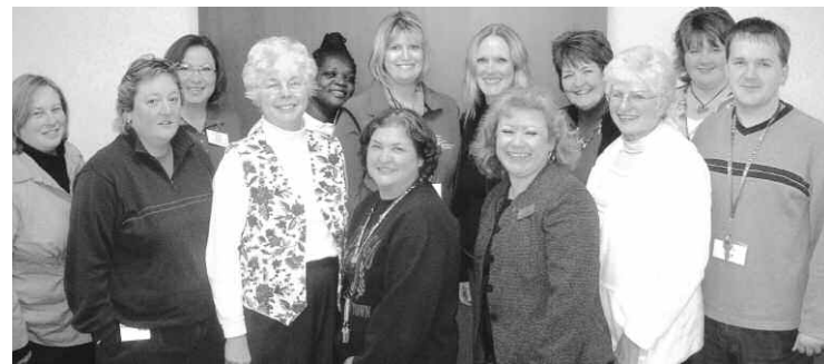
Representatives of local food pantries met at the Farm Bureau in St. Charles in mid-February to plan strategies for feeding the hungry in the area.

Those wishing to attend the event must RSVP by March 13, 2008 to the IAA Foundation, or register online at: www.iaafoundation.org . For additional information, contact the IAA Foundation at 309-557-2230.