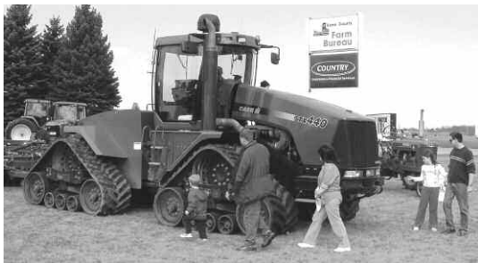
The public is invited to see farm equipment up-close at the Farm Bureau's award winning Touch-a-Tractor event, March 28 & 29 in St. Charles.

Rounding out the event for kids will be a pedal tractor "corral", scavenger hunt and farm animal zoo.