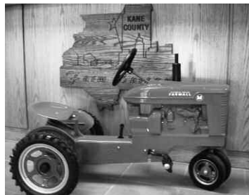
Enter your kids(s) (8 & under only) to win this pedal tractor FREE from the Kane County Farm Bureau. And be sure to bring them to Touch-A-Tractor, March 28 & 29, at the Farm Bureau in St. Charles.

The winner will be drawn March 29 at the Kane County Farm Bureau's Touch-A-Tractor event, at approximately 3 p.m. Winner need not be present to win.